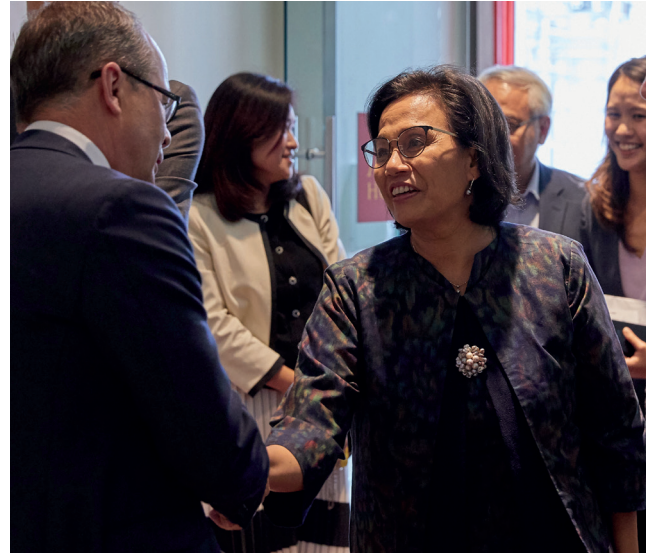
Indonesia's Finance Minister, Sri Mulyani Indrawati, meets Asia House Corporate Members in London.

Asia House's global network includes senior decision makers from governments, businesses and organisations around the world. Fellows will have the opportunity to join this network and build rewarding contacts in the sectors of interest to them.