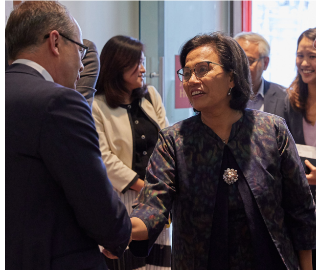
Indonesia's Finance Minister, Sri Mulyani Indrawati, meets Asia House Corporate Members in London.

Asia House's global network includes senior decision makers from governments, businesses and organisations around the world. Fellows will have the opportunity to join this network and build rewarding contacts in the sectors of interest to them.